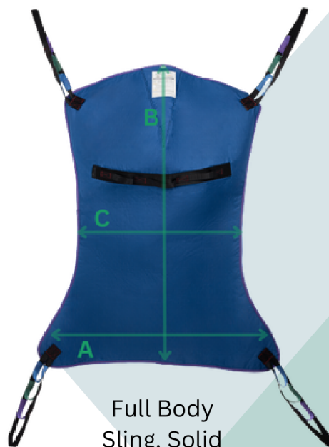
Full Body Sling, Solid