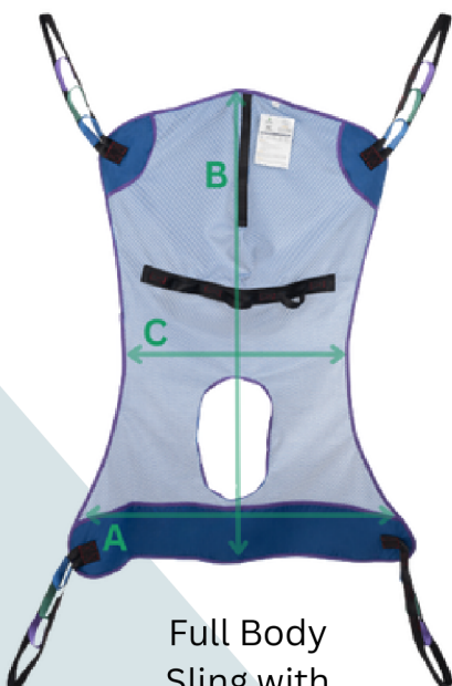
Full Body Sling with Commode, Mesh