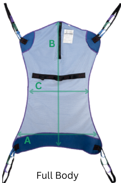
Full Body Sling, Mesh