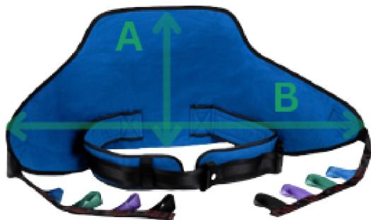
Sit to Stand Sling