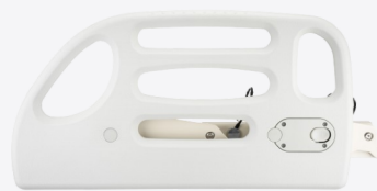
Soft Style Side Rails