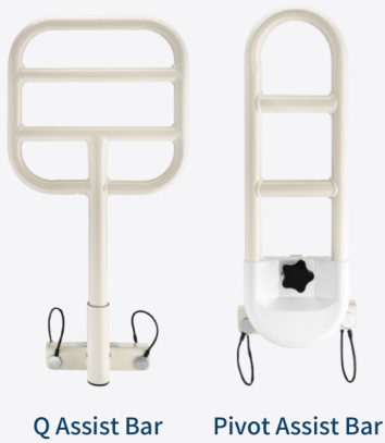
Q Assist Bar