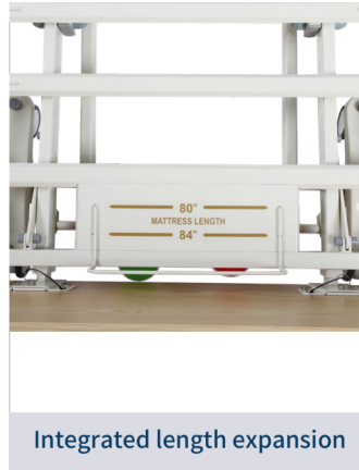
Integrated length expansion