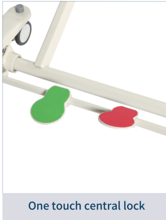
One touch central lock