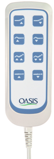
8 function hand control