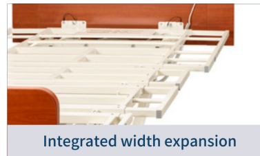
Integrated width expansion