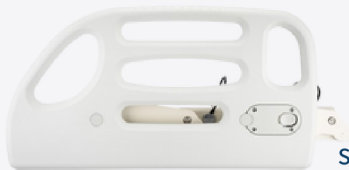
Soft Style Side Rails