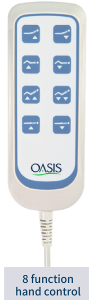
8 function hand control