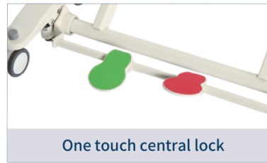
One touch central lock