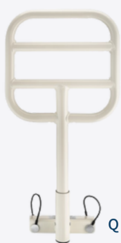
Q Assist Bar